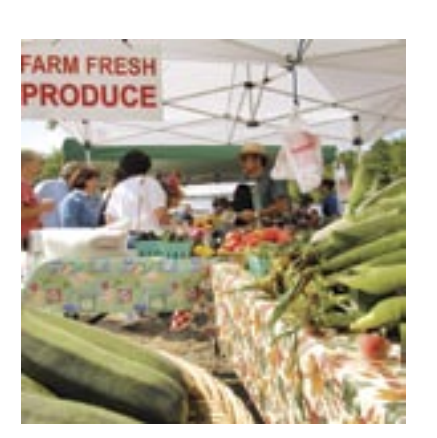
Farmers sell produce in Cuyahoga Valley.

Two projects, in particular, demonstrate the potential and scope of cooperative conservation for the largest of the nation's urban areas. In Chicago, a partnership formed to restore the area's remnant natural plant communities, including the tallgrass prairies that once dominated the region. The Chicago Wilderness consortium, formed in 1996, is leading the way in re-establishing the grasslands and oak woodlands that once flourished in the area and gave the landscape its distinctive flavor.