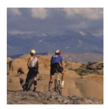
Cyclists enjoy the view at Utah's Sand Flats.

The faces and places of Sand Flats and Grand County, Utah, tell only one story among many citizen and community conservation efforts. Yet the themes of Sand Flats are universal and common, in part or in whole, to every practice and practitioner of cooperative conservation. The themes emerge on private and public lands, rural and urban settings, from plains to the mountains, coastal shores to inland lakes and waterways. It is this commitment of