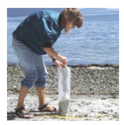
A Northwest Straits staffer collects samples.

Some collaborative management is heading toward network governance. The Detroit International Wildlife Refuge is working with a variety of state, city, community, landowner and business partners in Detroit to create a new kind of wildlife refuge—one managed as part of a larger metropolitan landscape and funded through networks of contributing partners. Crissy Field, part of the National Landmark Presidio in California, is managed by the Golden Gate National Recreation Area. Its restoration and current management draw from community participation and rest on an enduring sense of community ownership in the field and in the larger park.