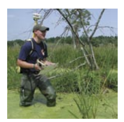
Biological monitoring helps restore marshes.

legacy is years, if not decades, in the future. Still, the excitement of citizens making a difference where they live is infectious; landowners draw in their neighbors, communities build coalitions with other communities, and partnerships of many sizes configure and reconfigure in anticipation of every new environmental challenge. A new conservation ethic is dawning as we begin the 21st century, characterized by Americans building a nation of citizen stewards.